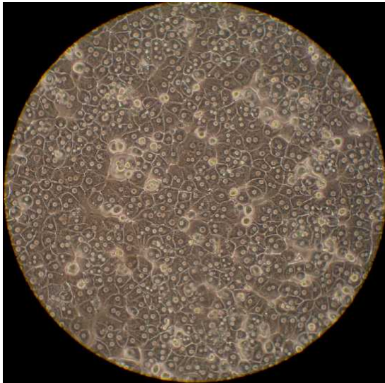
Figure 1. Morphology of rat hepatocyte cultured on collagen coated plates, 24 hr culture, 200X

BioChain's hepatocytes are prepared from primary isolates, plated in collagen coated T-75 flasks, and delivered next day. Each flask contains \sim 9 \times 10^6 cells. Hepatocytes plated on collagen coated multi-well plates are available upon request. Rat hepatocytes are well-characterized and quality-controlled by different assays such as albumin staining, albumin qRT-PCR analysis, cytochrome P450 activity (CYP1A1/1B1 assay).